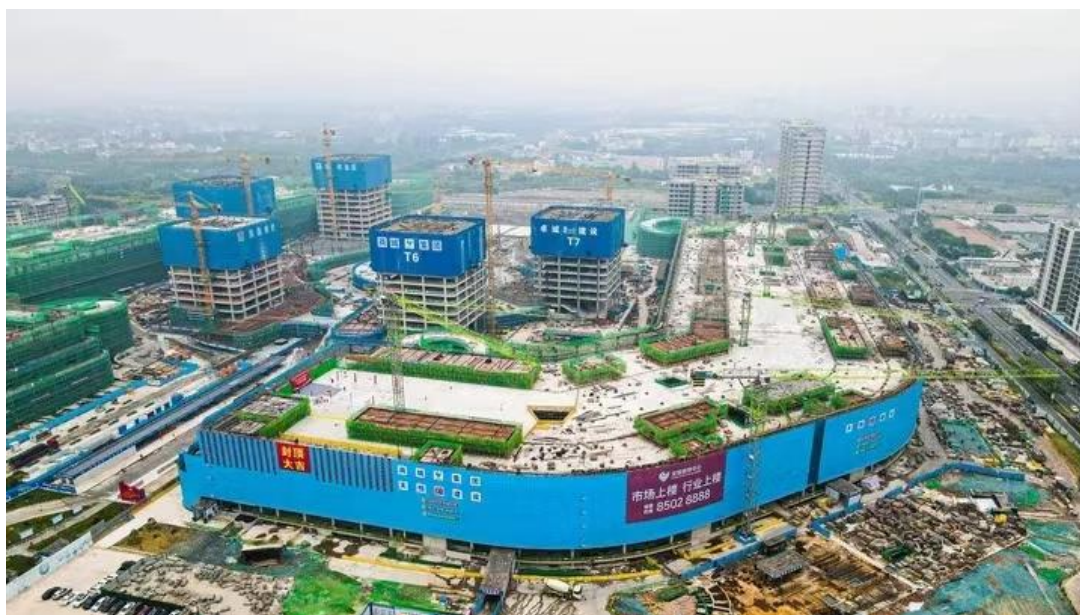
(Progress Map of the Global Digital Trade Center Project in June 2024)