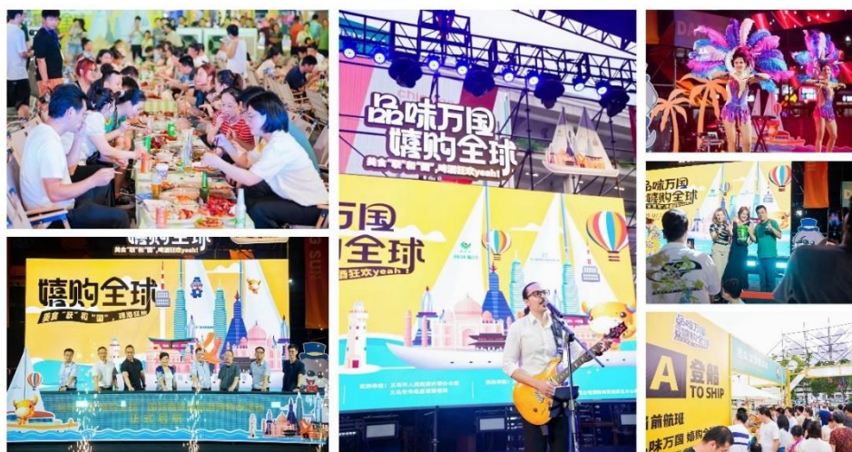
“品味万国 嬉购全球” 美食节活动

During the reporting period, the hotel business segment (including entrusted hotels) achieved revenue of RMB 227 million, a YoY increase of 1.3%, and GOP of RMB 24.7138 million, a YoY increase of 4.51%. The hotel segment actively implements the integrated development strategy of "market+cultural tourism" and "food+shopping", relying on the Yiwu market to build a comprehensive consumption scene integrating shopping, food, and tourism. It is committed to creating a unique market cultural tourism IP to significantly enhance the attractiveness and popularity of the market cultural tourism. The "Taste Global Delicacies, Buy Global Products" food festival held at the end of June attracted 17 well-known foreign flavor catering units in Yiwu city to participate. The event was brimming with attendees, and its overwhelming popularity led to a scarcity of tickets. The mesmerizing fusion of live dance, music, and lighting elicited exuberant cheers from the crowd, as the array of delectable food, beer, and snacks provided a veritable feast for the guests. The event surpassed all expectations.