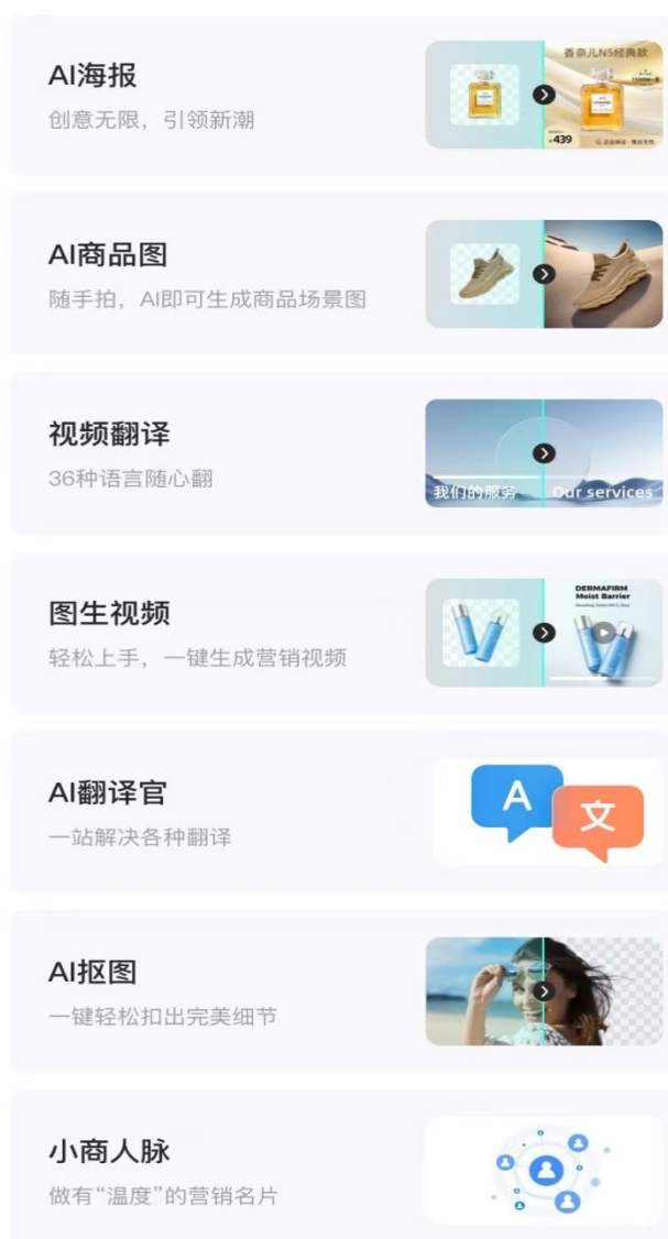
(Display of Some AI Applications)

users on the Chinagoods platform have deeply experienced the Xiaoshang AI series, which helps market merchants achieve digital upgrades in their business.